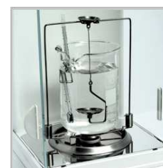
Hydro ATN kit